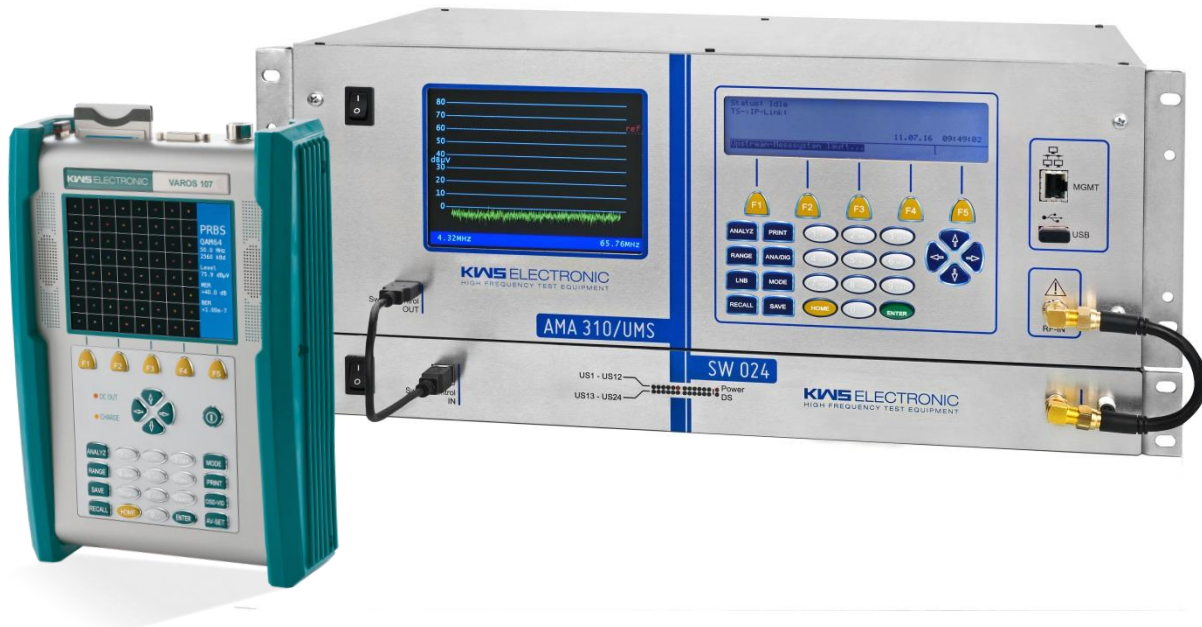
High-end single channel / 24 channel return path monitoring system