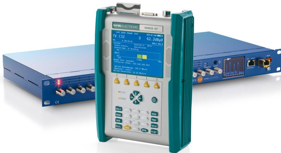
16 channel return path monitoring system (cascadable up to 256 inputs)